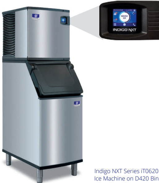
Indigo NXT Series iT0620 Ice Machine on D420 Bin

Designed for operators who know that ice is critical to their business, the Indigo NXT Series ice machine's preventative diagnostics continually monitor itself for reliable ice production. Improvements in cleanability and programmability make your ice machine easy to own and less expensive to operate.